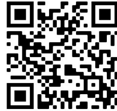
QR Code for Registration

A handwritten signature in blue ink, appearing to read 'Singh'.