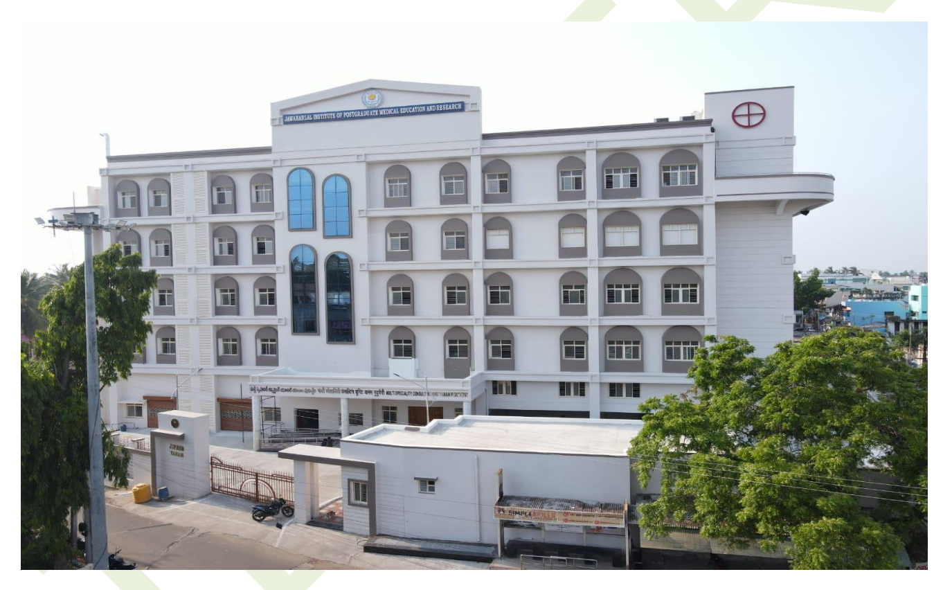
JIPMER Multi-Specialty Consulting Unit, Yanam

JIPMER has established a Multi-specialty Consulting Unit at Yanam district, Government of Puducherry to provide health care and treatment facilities. JIPMER, a model for health systems in India and through innovations in education, patient-oriented research and population health service in excellence will extend its medical facilities to the people of Yanam region through the Multi-Specialty Consulting Unit at Yanam. The unit will provide facilities only in selected specialties / superspecialties.