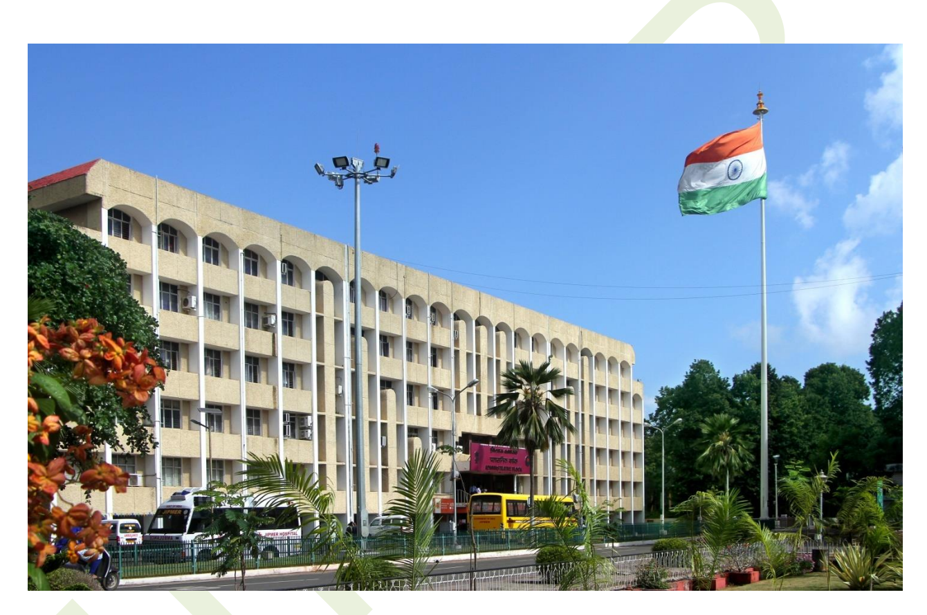
Administrative Block, JIPMER Puducherry